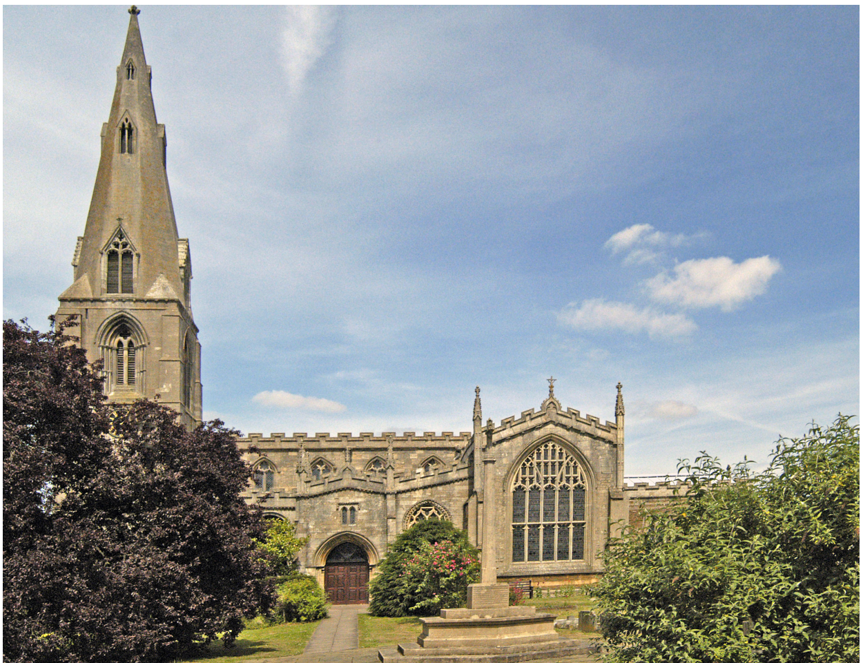
Modern view of St Peter & St Paul Langham - War Memorial in the foreground To the left of the path is the new area of church yard created after re-routing the brook