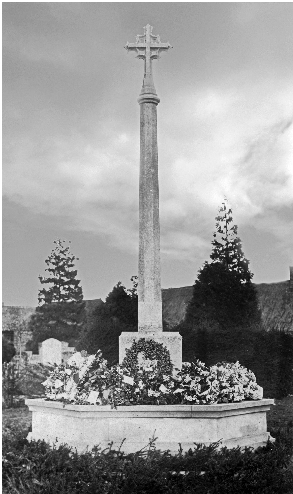
New Memorial after the unveiling - York stone paving not yet in place