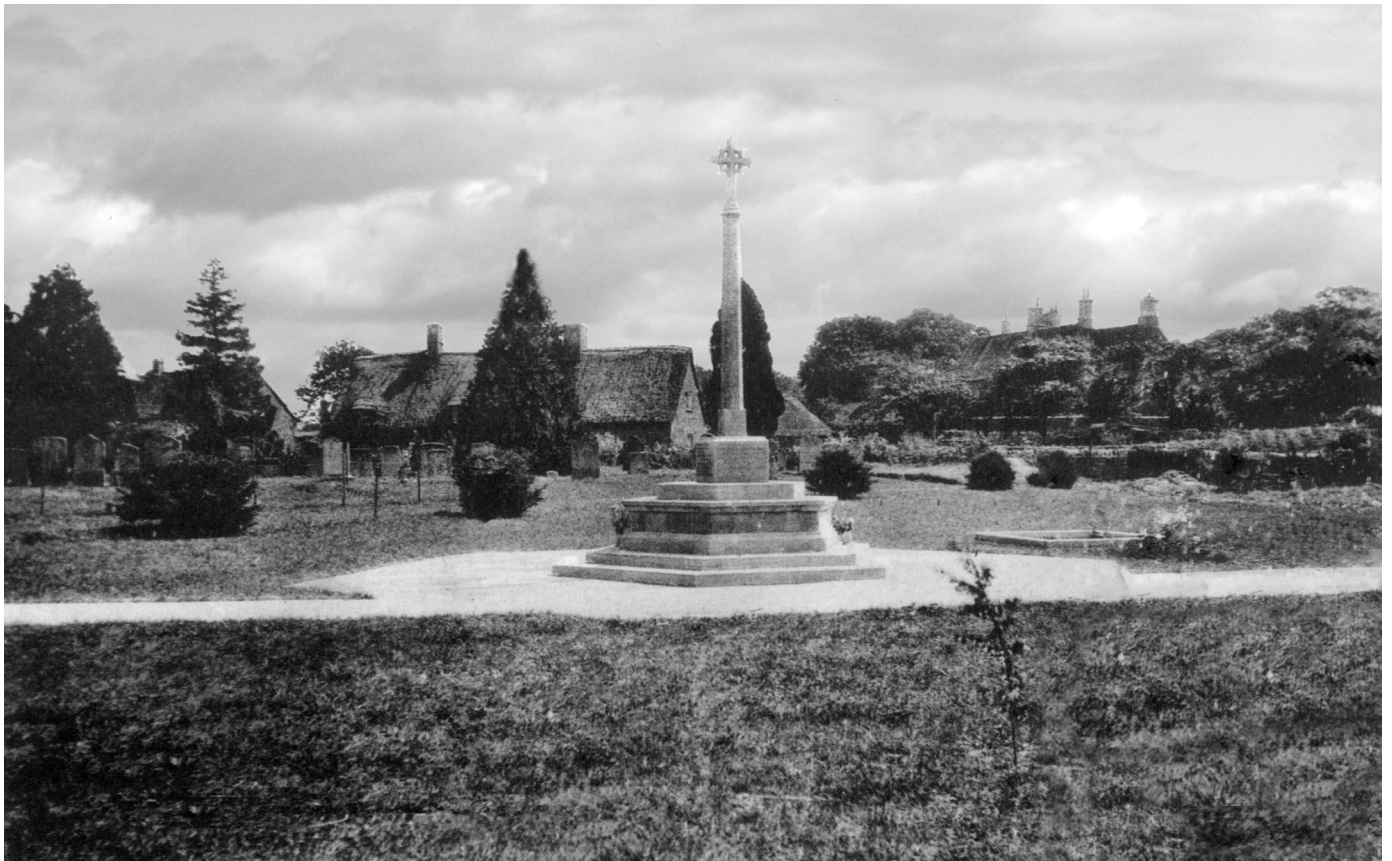
War Memorial and paving newly completed